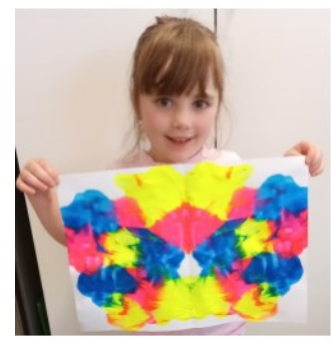
We are proud of our paintings used to make Butterflies. by Kindy A