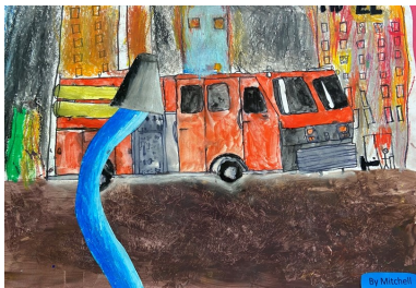
Mrs Narelle Cridland Art Specialist Teacher

The students discussed the picture plane and identified the different grounds—foreground, background and middle ground. They then used different mediums to infill the grounds including oil pastel, water colour and acrylic paint. Here is a small sample of the beautiful work they produced.